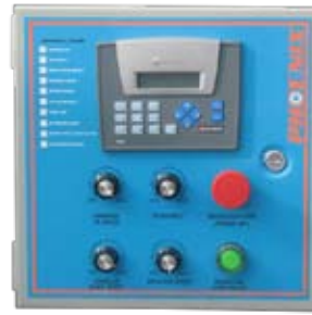
Standard Control Panel