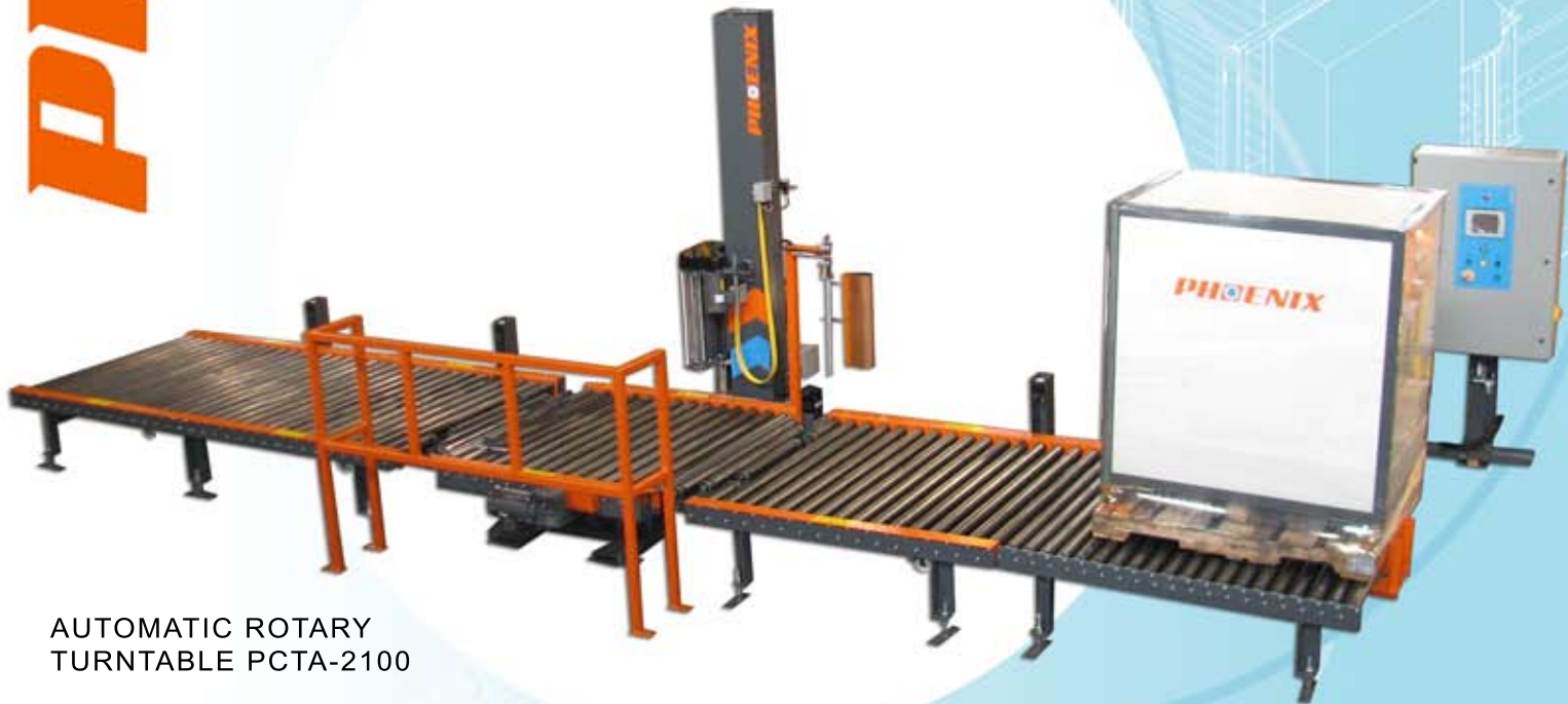
AUTOMATIC ROTARY TURNTABLE PCTA-2100