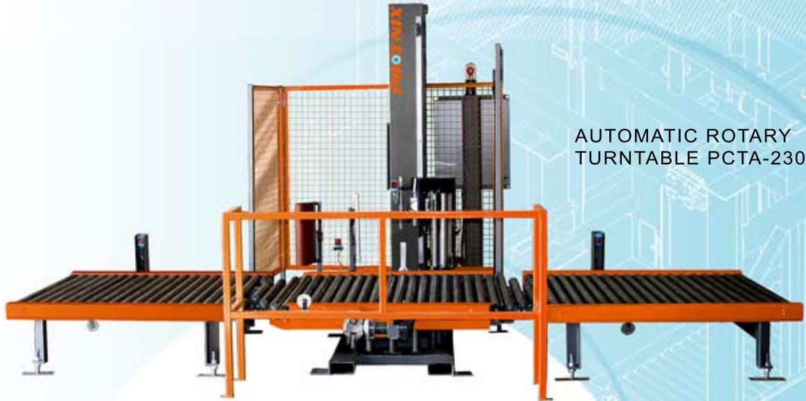
AUTOMATIC ROTARY TURNTABLE PCTA-2300