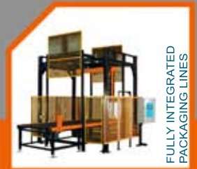
FULLY INTEGRATED PACKAGING LINES