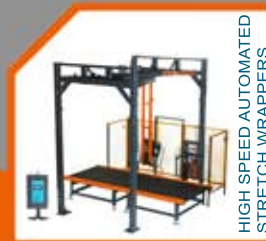
HIGH SPEED AUTOMATED STRETCH WRAPPERS