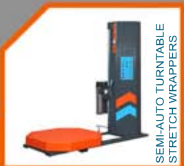
SEMI-AUTO TURNTABLE STRETCH WRAPPERS