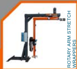
ROTARY ARM STRETCH WRAPPERS