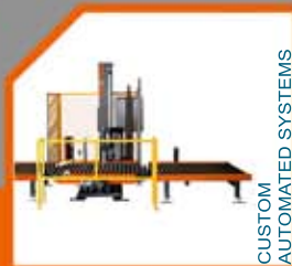
CUSTOM AUTOMATED SYSTEMS